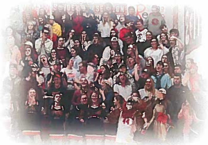
Our amazing student section at a HS boys' basketball game!

Interesting Fact: Fairfield High School has 17 teachers and 4 educational aides! There are currently 299 students enrolled. 261 attend classes at Fairfield High School and 38 are attending JVS or CCP classes full-time.